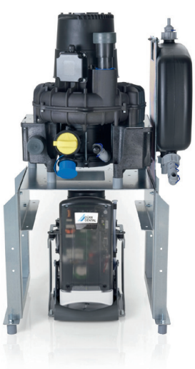
The simple and space-saving solution for supplementing the combination suction units (e.g. VS 600, VS 900 S, VS 1200 S) with an amalgam separator

Attractive design, excellent performance and a convenient disposal concept make the CA 4 amalgam separator from Dürr Dental a system unit which is convincing in every detail. Perfectly equipped for the connection of several treatment units, the unit offers superior state-of-the-art technology. The CA 4 works according to the centrifugal principle with hydrodynamic self-cleaning. As soon as waste water is available from the treatment unit, the system automatically switches on. A visual display provides information on the current operating condition at all times.